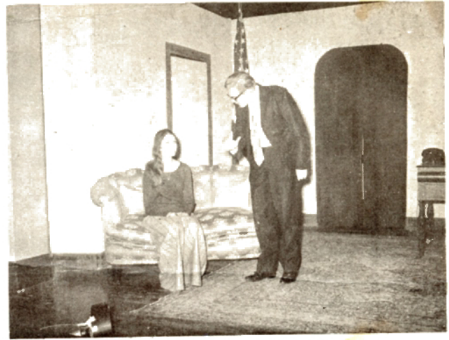
"Now it's a psychotic diplomat you like - I liked the draft-dodger better."