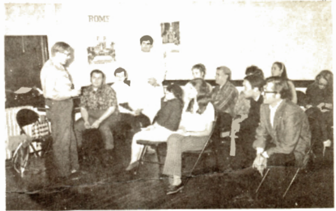
The director chats with the cast during a rehearsal break.