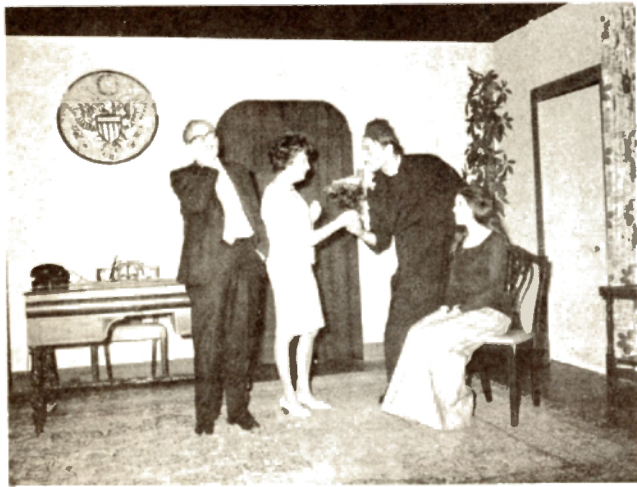
"It's nice for a man of the cloth to have another hobby besides God."