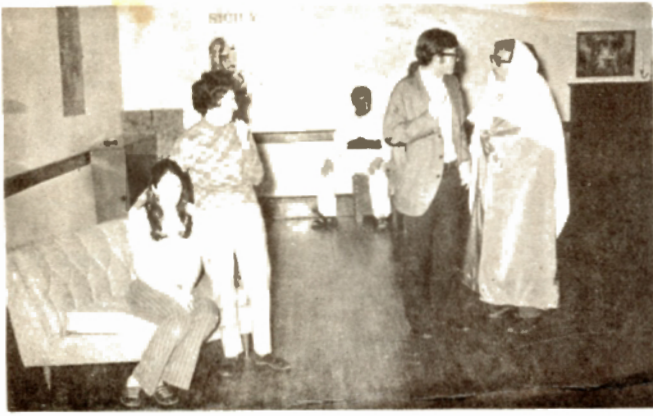
Hard at work in rehearsal.