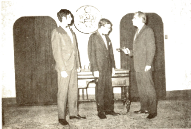
"Nobody can be dragged out of our Embassy and shot without the written consent of the American government."