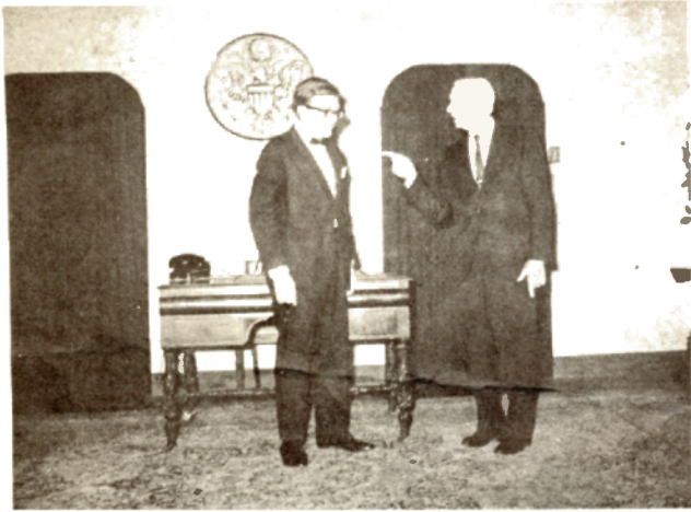
"And if your own father fires you it's the end of the line."