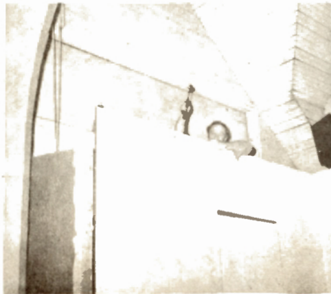
Things begin to take shape.