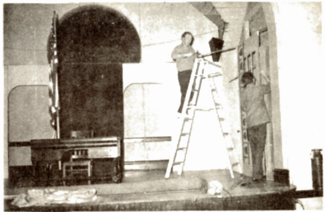
Skip Evans, set productions chief, begins the task of building a set.