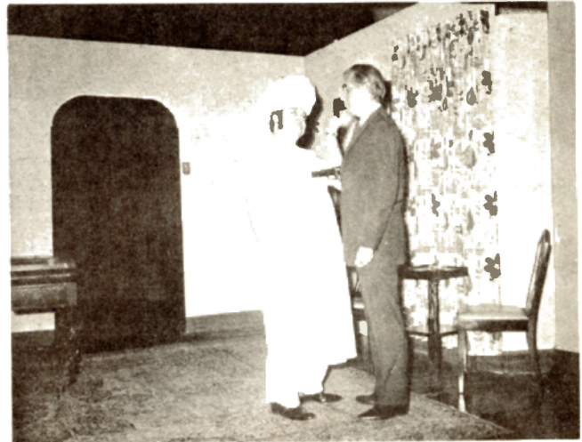
"I had a cake in the oven and your gunshots made it fall."